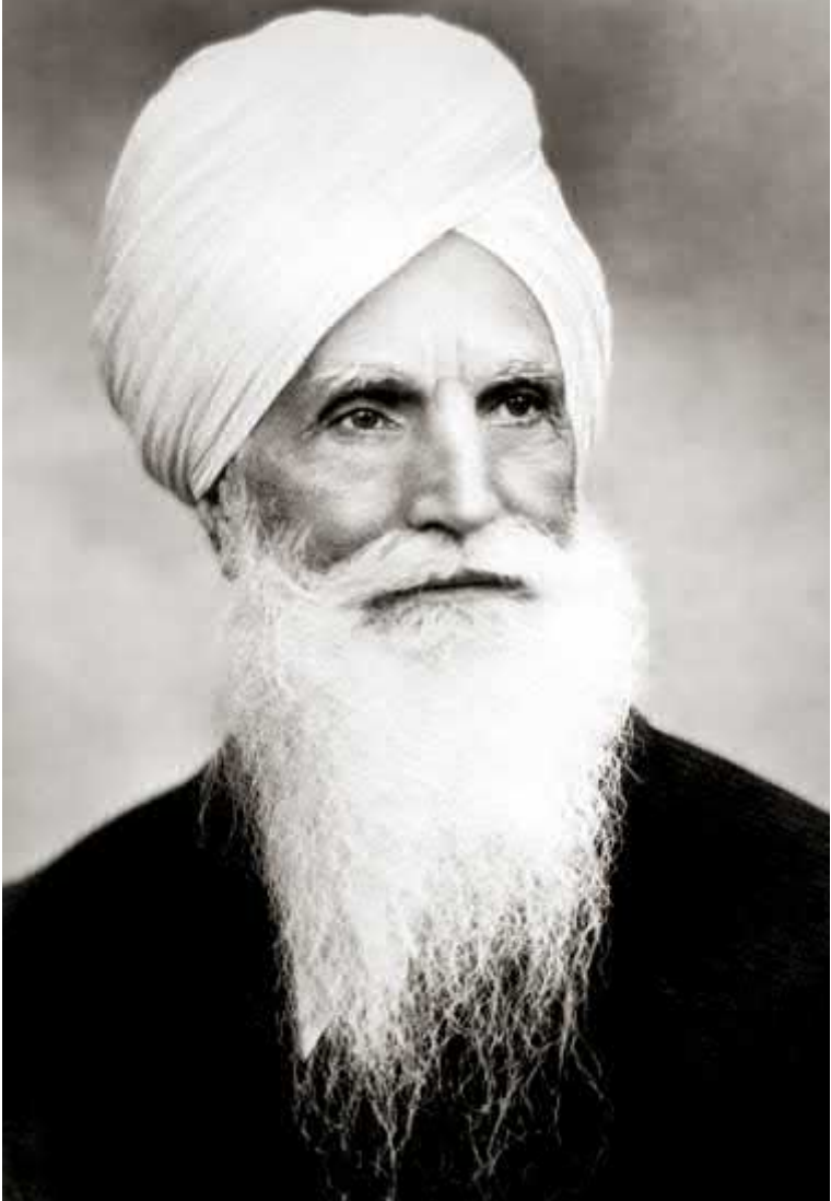
Baba Sawan Singh Ji (1858-1948)