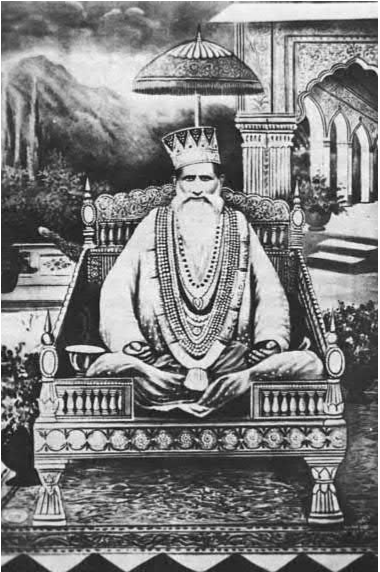
Swami Ji Maharaj Shiv Dayal Singh (1818-1878)