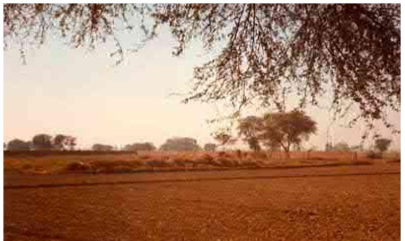
Above left: Old "Langar", 1983