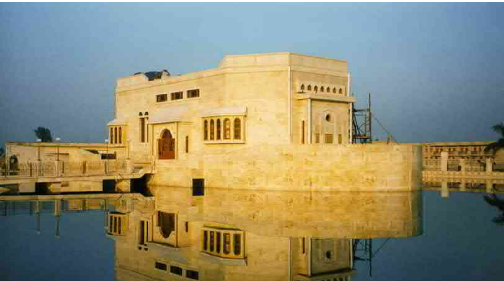
Below: Sarovar, 2000