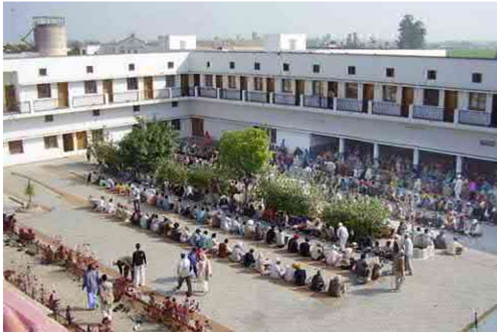
Courtyard of the Langar