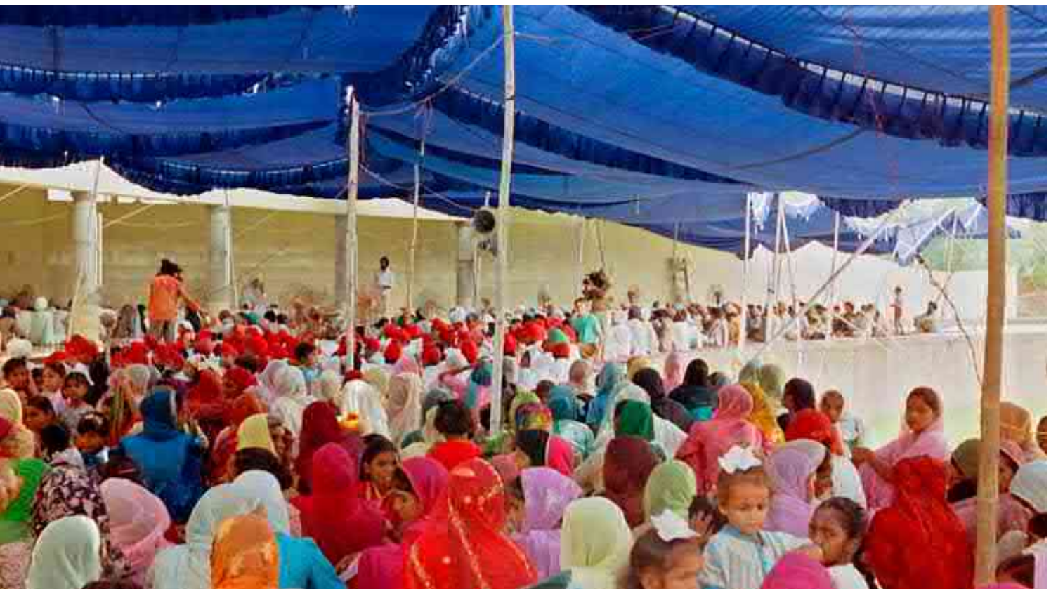
Satsang in the Sarovar, 1993