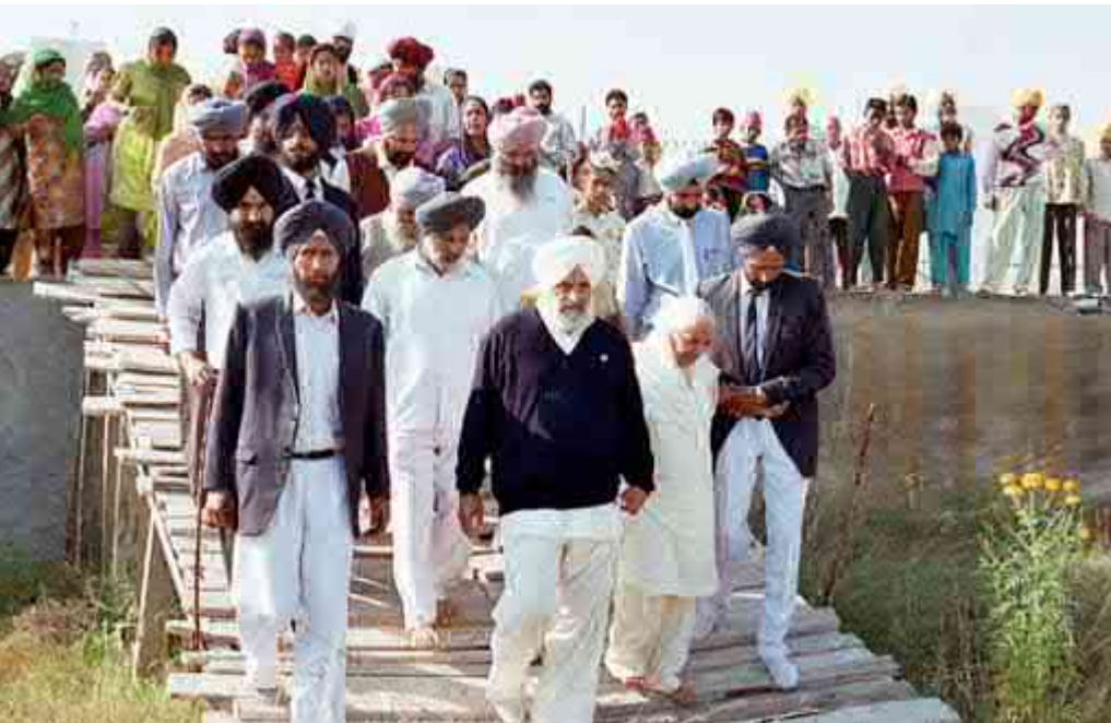
16 November, 1994