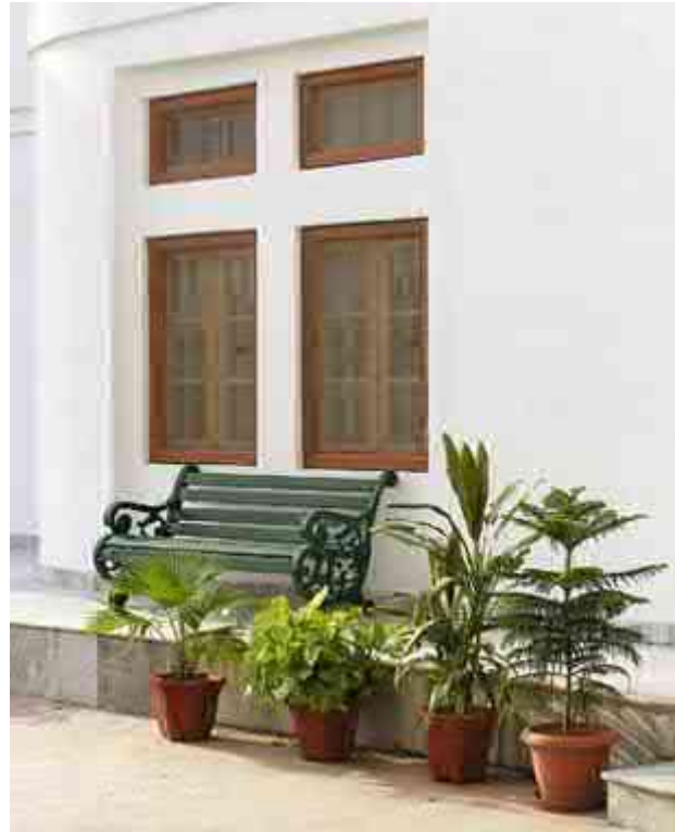
Above left: Sangat House, 2007 Below left: Foyer in the Guest House Below right: Reception in the dining room, 1994