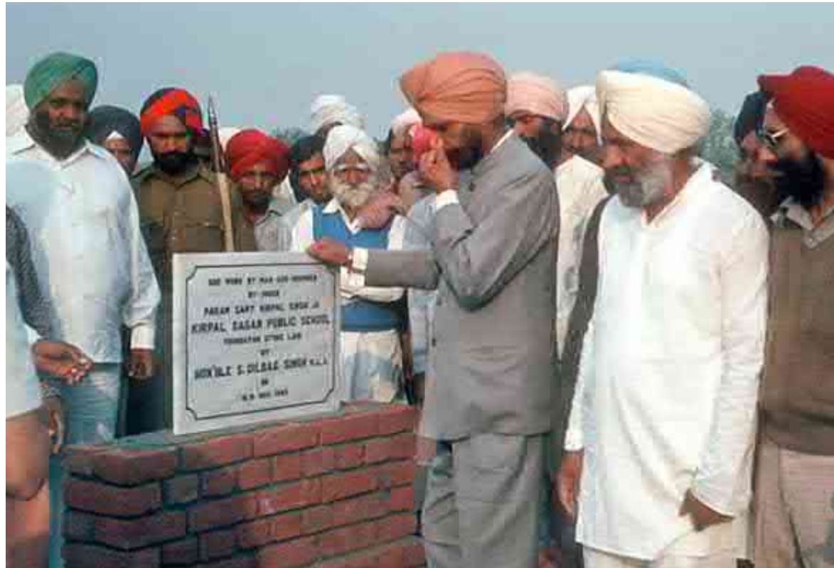
Right: Laying the foundation stone for the future Kirpal Sagar Academy, 1983 Below: Kirpal Sagar Academy, 2007