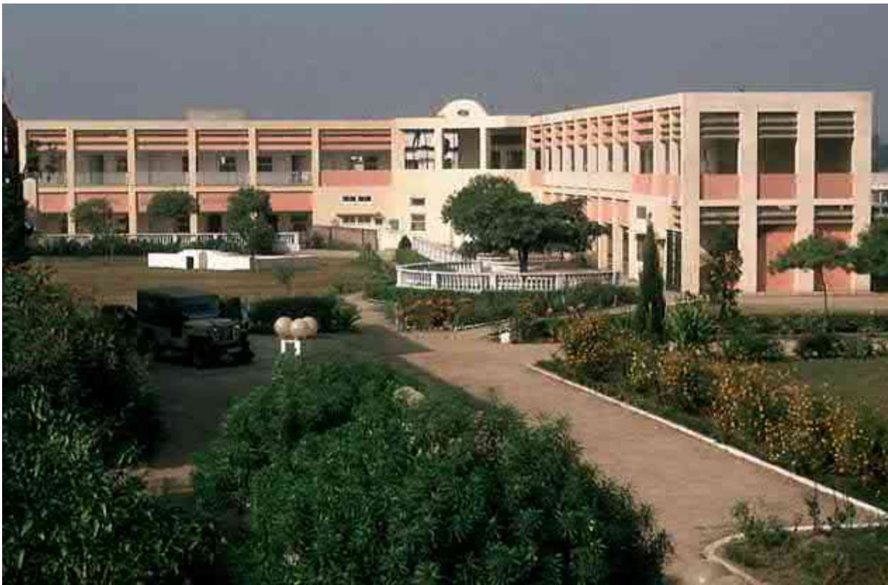
Right: Hospital. 1993