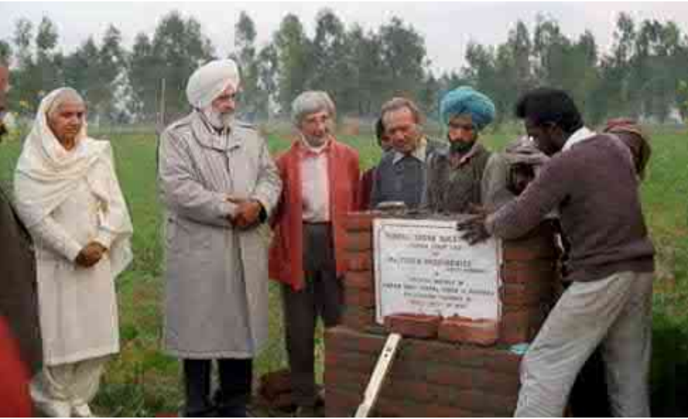
Above left: Laying the foundation stone of the Guest House Below left: Guest House, 2007 Right: Entrance of the Guest House, 2007.

In co-operation with Western helpers the Guest House was accomplished in February 1994