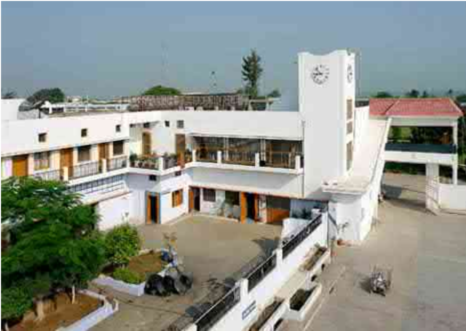
Part of the Langar where the visitors mostly stayed until 1994

The first floor in the Langar accommodates Bhaji's and Biji's room. In the beginning the workers also stayed in the Langar and enjoyed to live door to door with Bhaji and Biji.