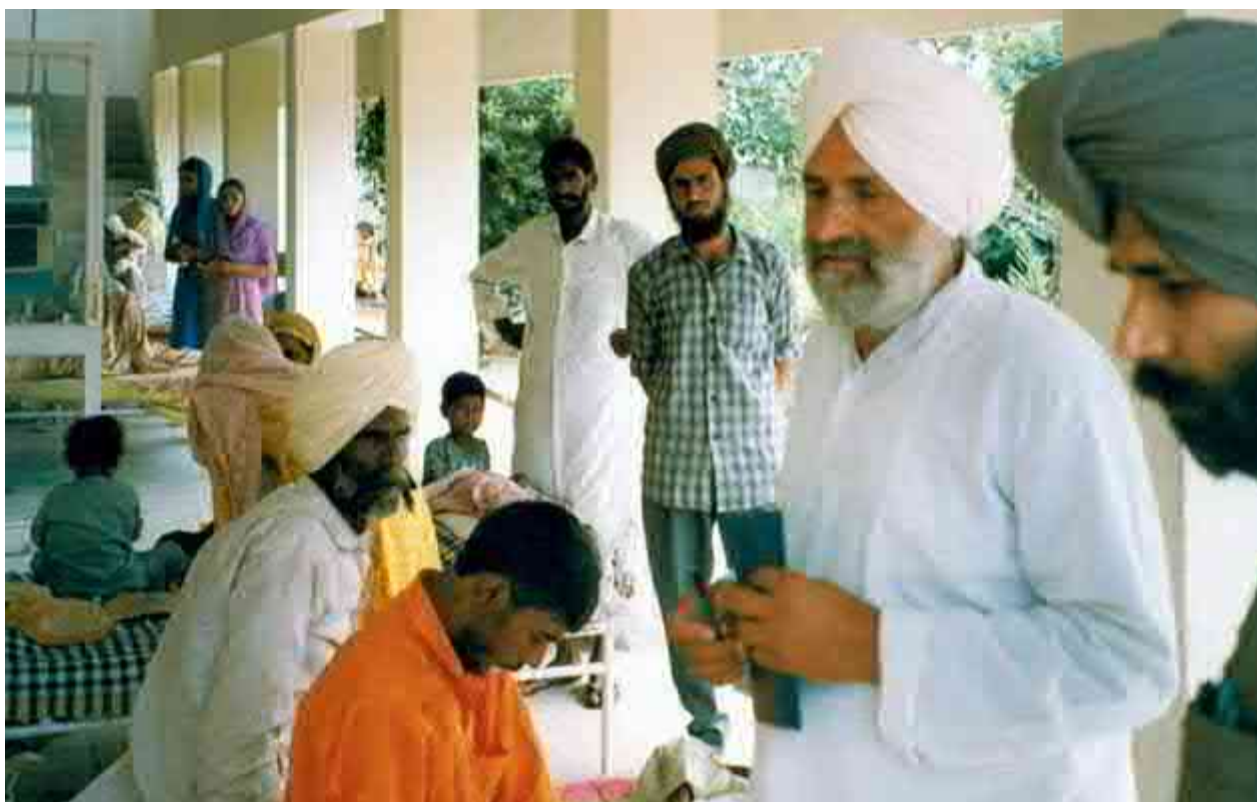
Left and right: Free medical care for needy patients