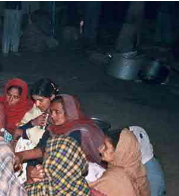
Biji in the Langar, 1986