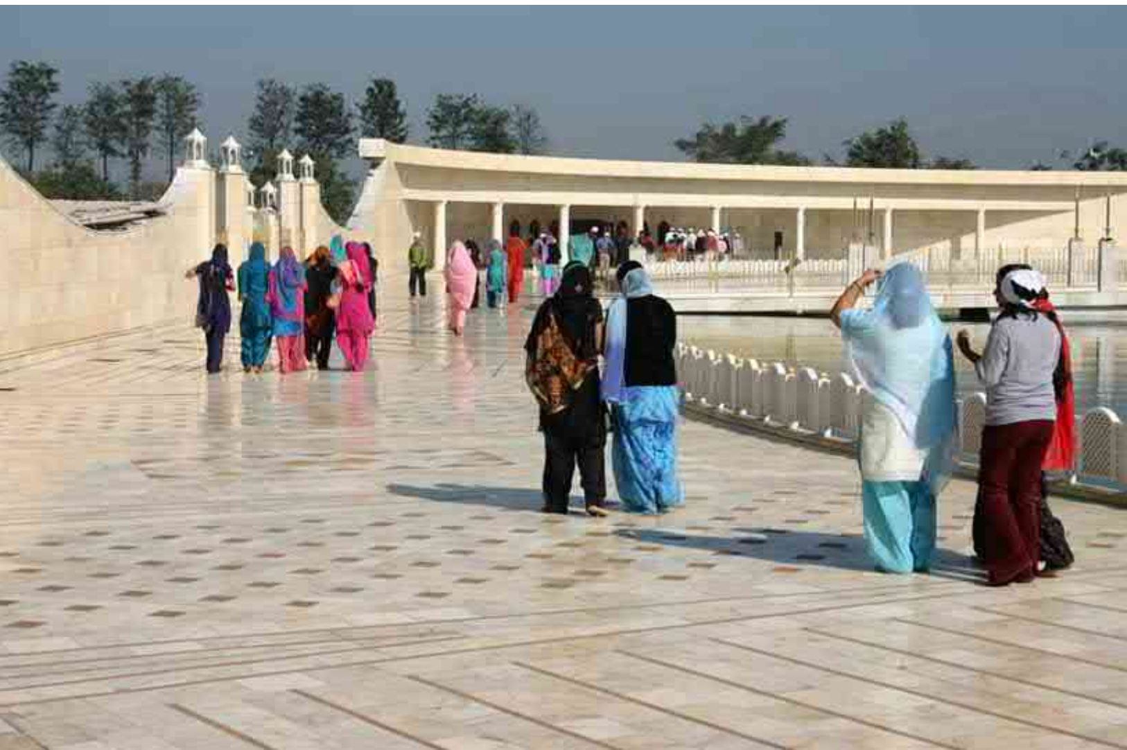
Circuit in the Sarovar, called Parkarma

Kirpal Sagar includes various facilities: Kirpal Charitable Hospital, Kirpal Sagar Academy, Fathers' Home, Library, Sarovar, Kirpal Bhawan, Guest House, Lan- gar and Management House, Agriculture and Dairy Farm and several Workshops.