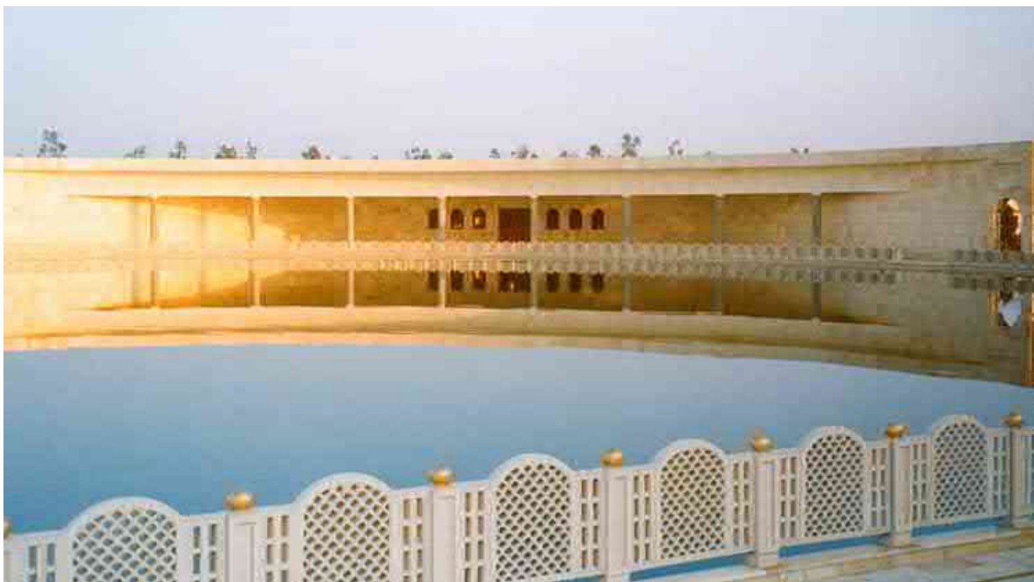
One Corner of the Sarovar