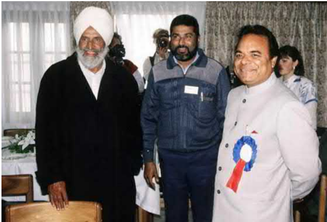
Below right: Reception in the dining room, 1994