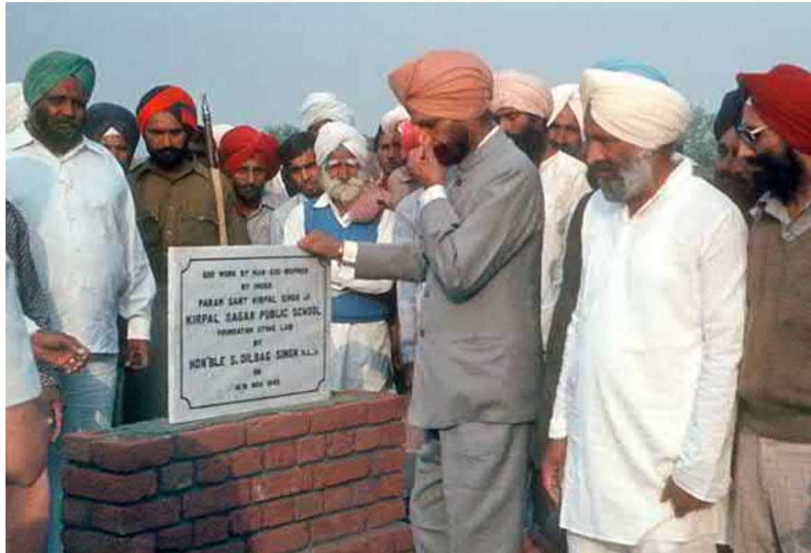
Right: Laying the foundation stone for the future Kirpal Sagar Academy, 1983 Below: Kirpal Sagar Academy, 2007