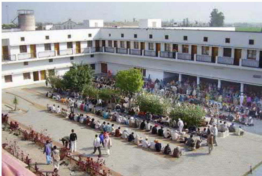
Courtyard of the Langar