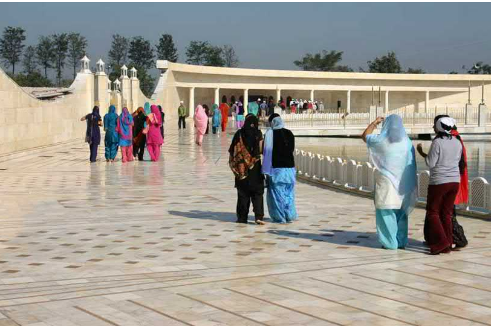
Circuit in the Sarovar, called Parkarma

gar and Management House, Agriculture and Dairy Farm and several Workshops.