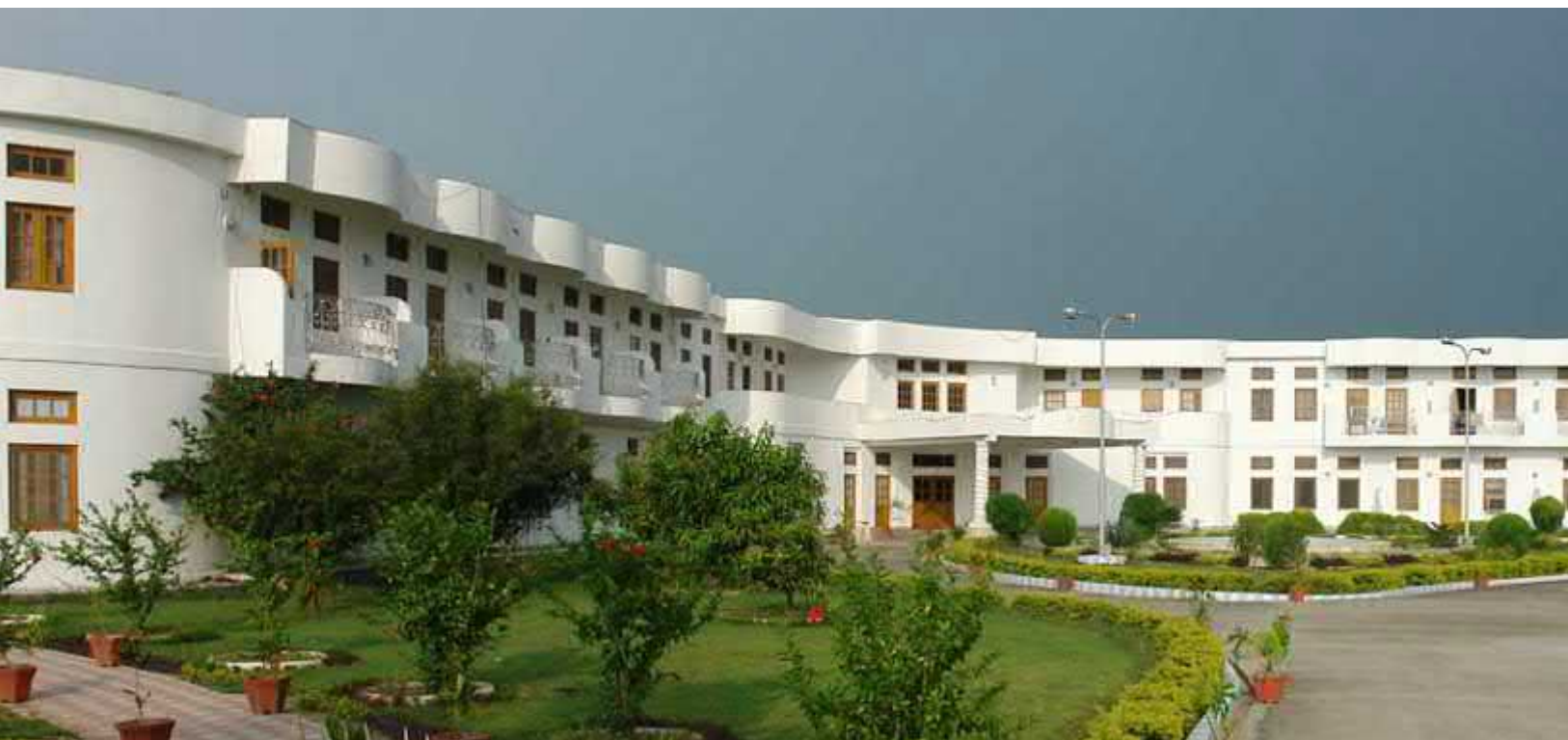
Right: Entrance of the Guest House, 2007.