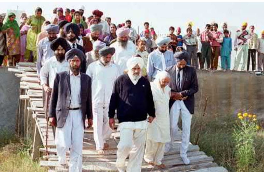
16 November, 1994