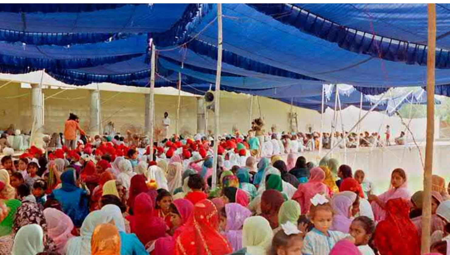
Satsang in the Sarovar, 1993