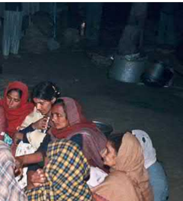
Biji in the Langar, 1986