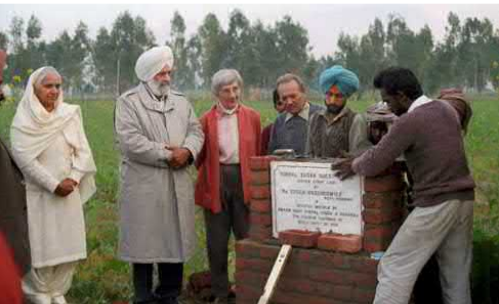
Above left: Laying the foundation stone of the Guest House

In co-operation with Western helpers the Guest House was accomplished in February 1994