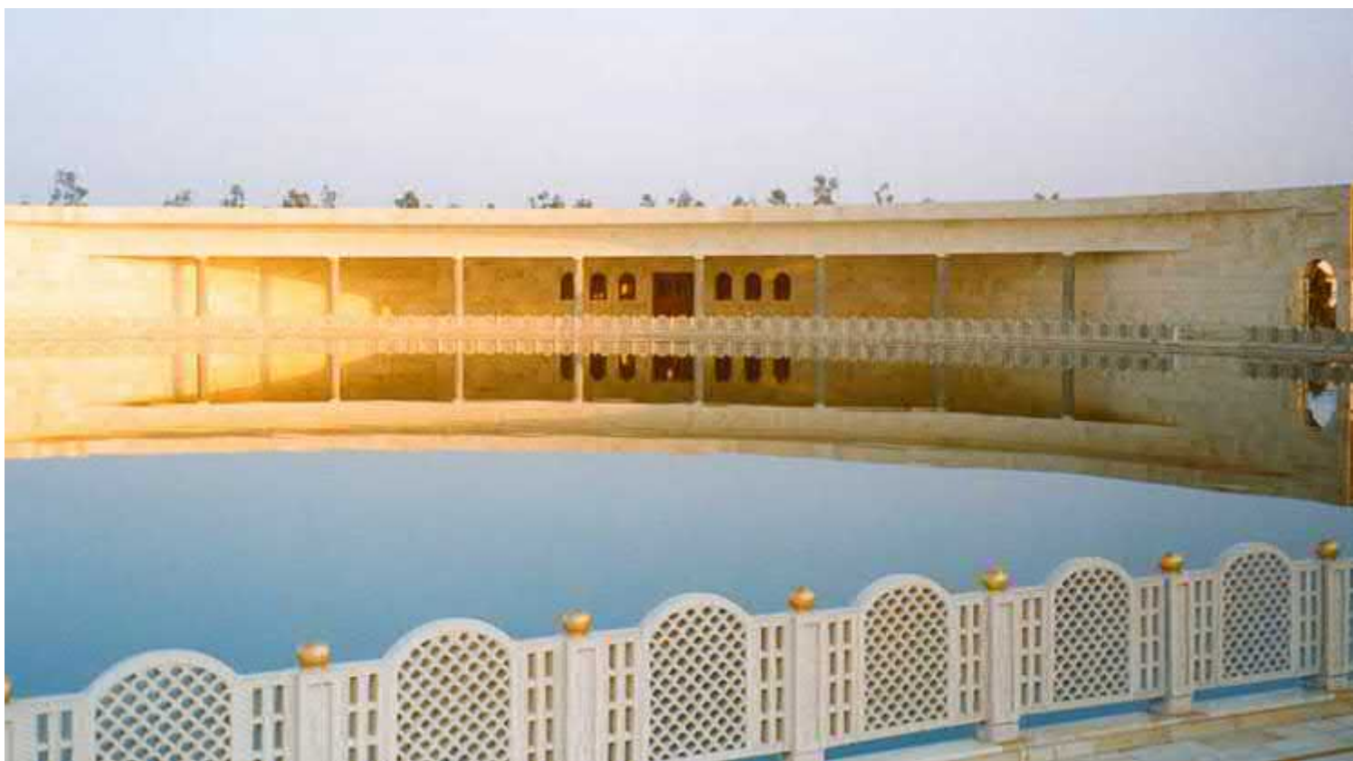
One Corner of the Sarovar