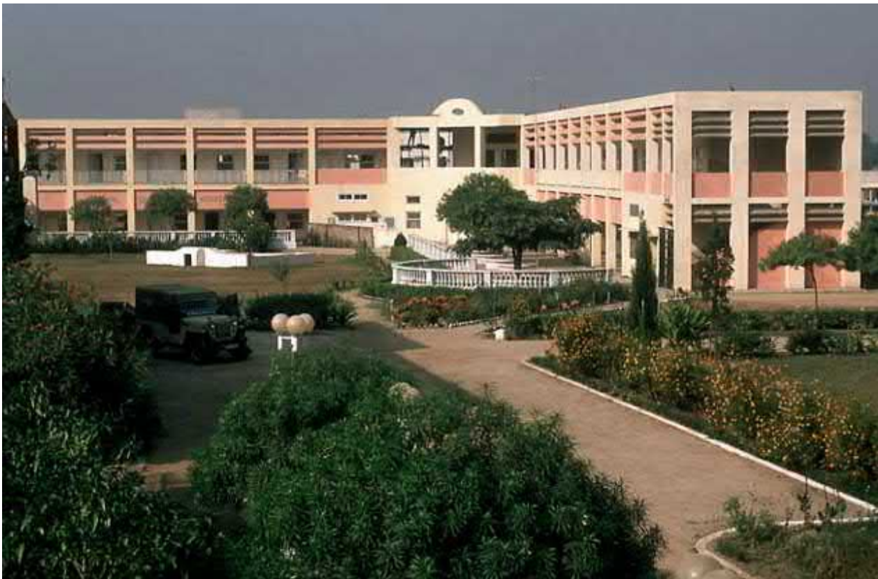
Right: Hospital. 1993