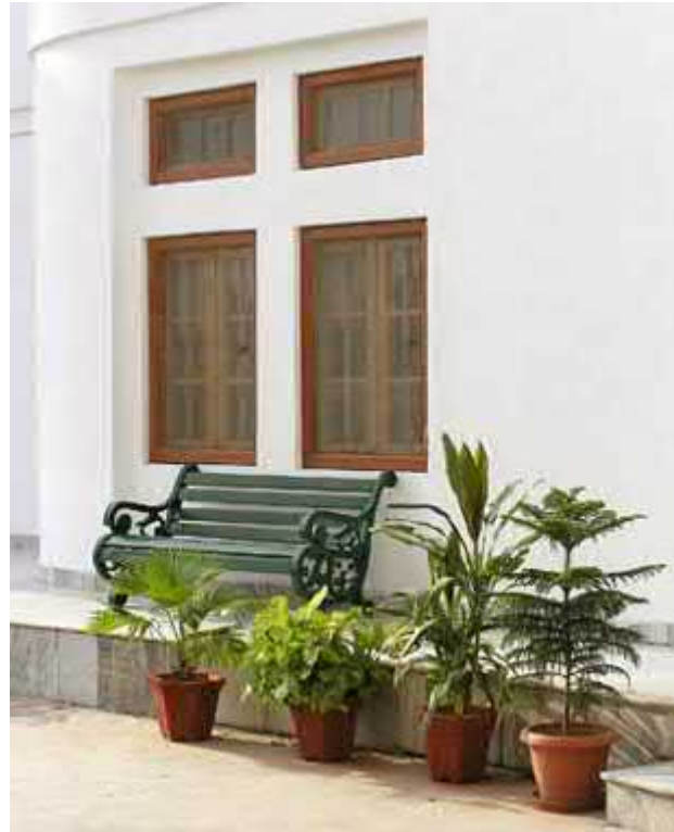
Above left: Sangat House, 2007