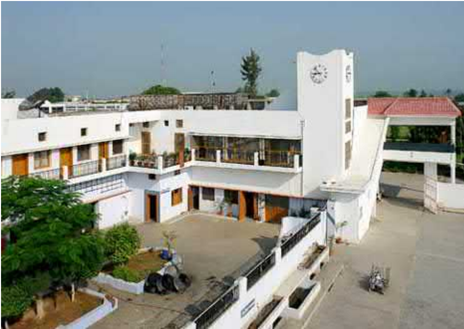
Part of the Langar where the visitors mostly stayed until 1994

The first floor in the Langar accommodates Bhaji's and Biji's room. In the beginning the workers also stayed in the Langar and enjoyed to live door to door with Bhaji and Biji.