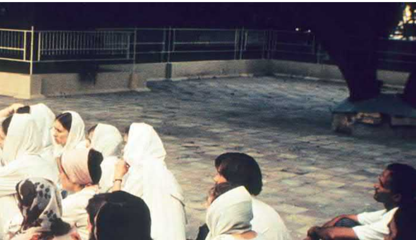
Sant Kirpal Singh, Sawan Ashram Delhi, August 1974

you have only the sweet remembrance of the Masterpower – think of Him and He is there.