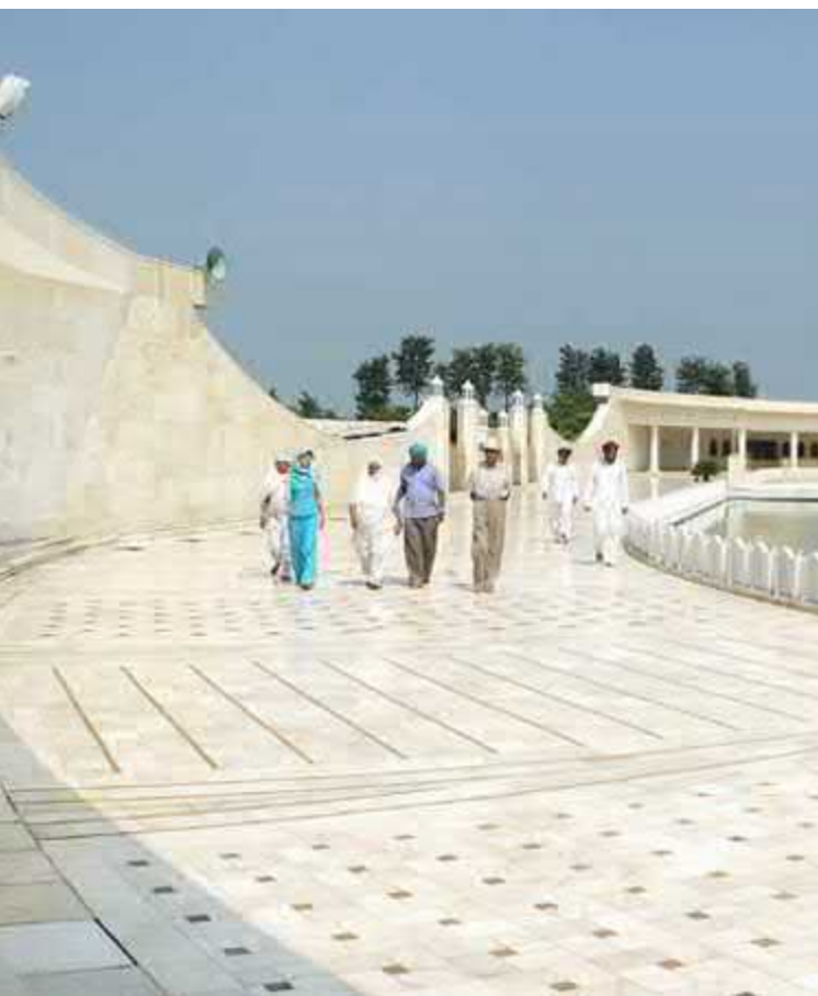
Partial view of the Sarovar

Kirpal Sagar includes several facilities serving the well-being of man in all aspects: