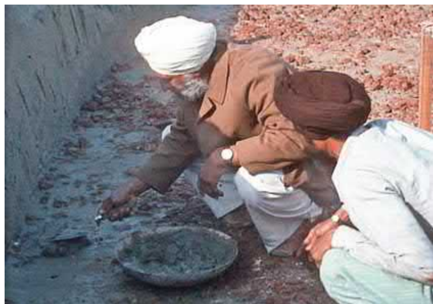
Left: Sarovar at the beginning of the construction work, February 1982