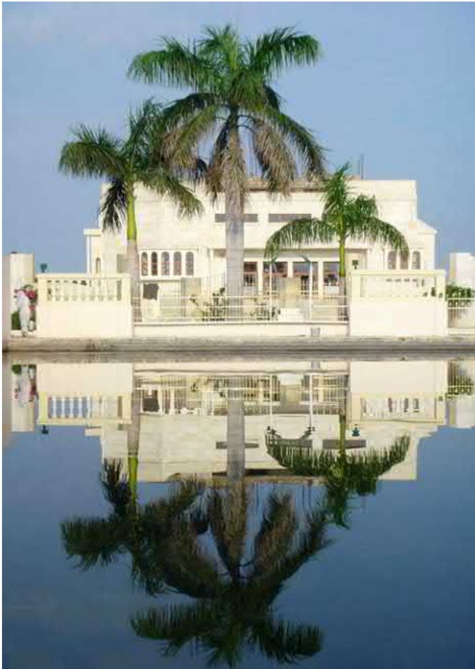
Partial view of the Sarovar

The heart of the project is a Sarovar , an oval-shaped pool surrounded by four corner buildings, where four symbols of different religions – a gurdawara, a temple, a church, and a mosque – exist, demonstrating the basic necessity for a true person to understand that God made man and man made religion. True religion tells all to get together under one canopy to remember Him.