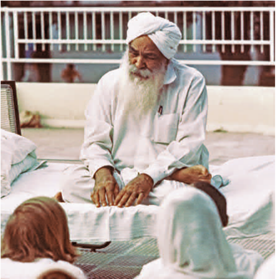
Sant Kirpal Singh, August 17, 1974